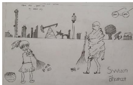
3 rd Rank